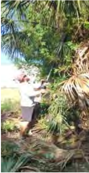
CLEANUP DAY! Noah Lodge and Cape Coral Lodge Workin' together - AGAIN.